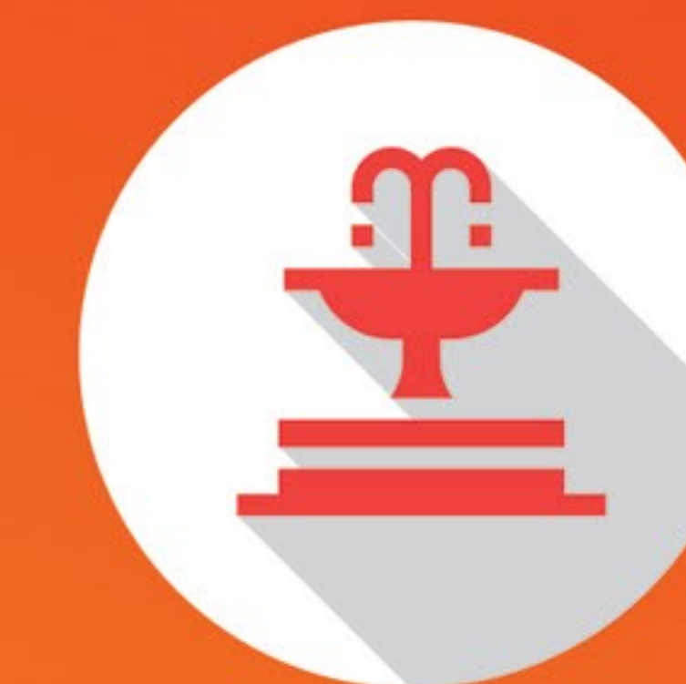
Pebble Area with Waterscape